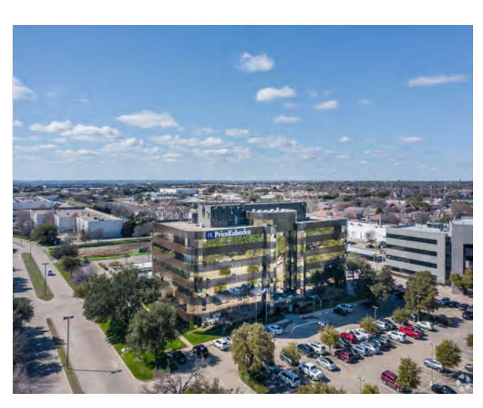
Location 16775 Addison Road